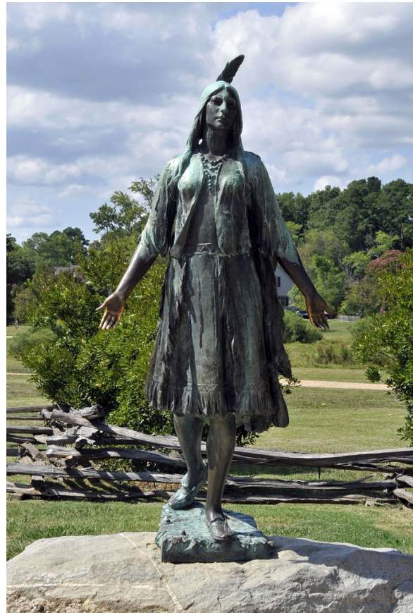
Statue of Pocahontas at Historic Jamestowne.

Jamestown-Yorktown Foundation http://www.historyisfun.org/jamestown-settlement/powhatan-village/pocahontas-and-the-powhatans-of-virginia/