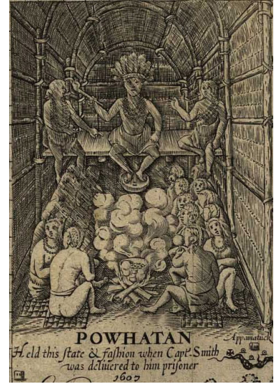
Inside a longhouse with Chief Powhatan (detail of John Smith map, 1612)

longhouse "the three sisters" fishing hunting English settlers basket making Powhatan "toys"